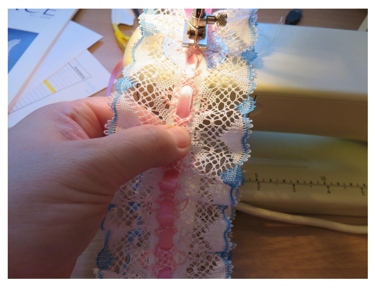
When finished either tie the ends of the ribbon to form a bow or add one, possibly in a slightly wider ribbon. Your garter is now complete!

The ribbon needs to be longer than the stretched garter length. Fix one end of the ribbon with a pin then sew with the garter stretched through the centre of the ribbon (I use a colour on top in the sewing machine that matches the ribbon). There is no need to pin in advance